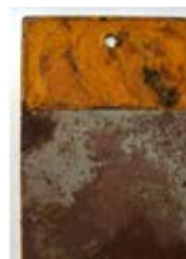
Protected by plain tape for 96 hours

We offer a full range of products for all types of situations.